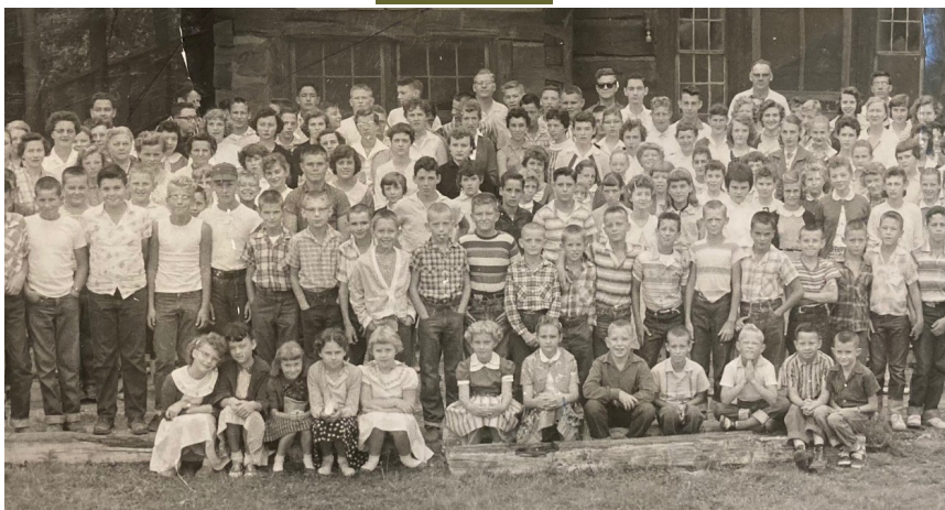
Camp photo in front of the Old Lodge. Circa late 1950's—1960's

The removal of Parker Hall has progressed well. We are done with the demolition process. This completes phase one and we have planted grass seed to cover the dirt in preparation for phase two.