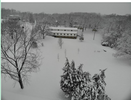
Campus was covered in snow for most of the month of January